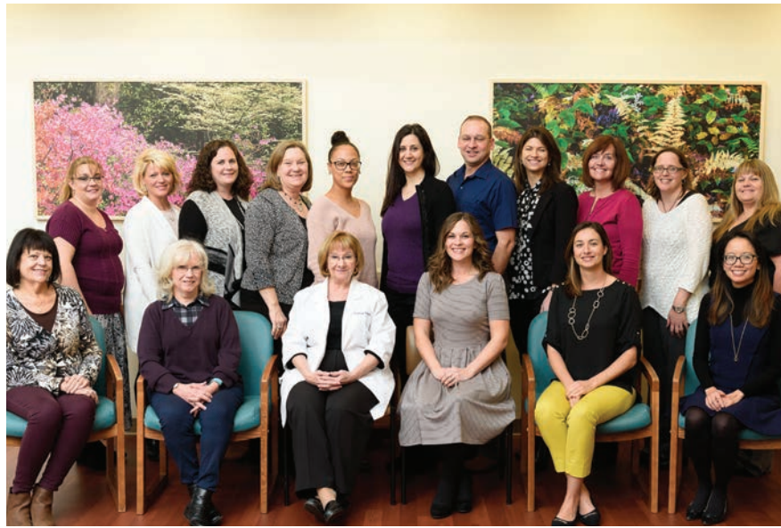
The Care Transitions staff is here to help you avoid a health crisis and live a longer, healthier life. For more information about programs and services, call the CARE Clinic at 301-360-2574.

CENTER FOR DIABETES AND NUTRITION SERVICES Helps patients understand diabetes and take control through carbohydrate counting, blood sugar monitoring, meal planning, and weight management.