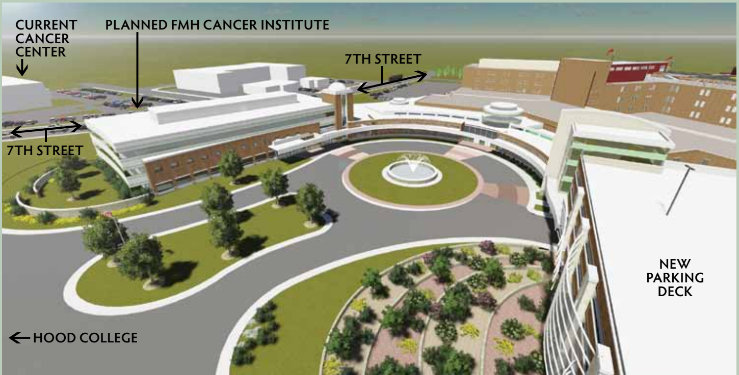
Artist's rendering of FMH campus improvements, including one possible design for the new Cancer Institute.

Frederick Memorial Hospital is expanding its award-winning oncology program into a fully integrated, comprehensive Cancer Institute. Because the number of cancer cases will rise significantly in the next decade, FMH is planning a new facility that will build upon its rich history of outstanding cancer care, and provide for new and improved services.