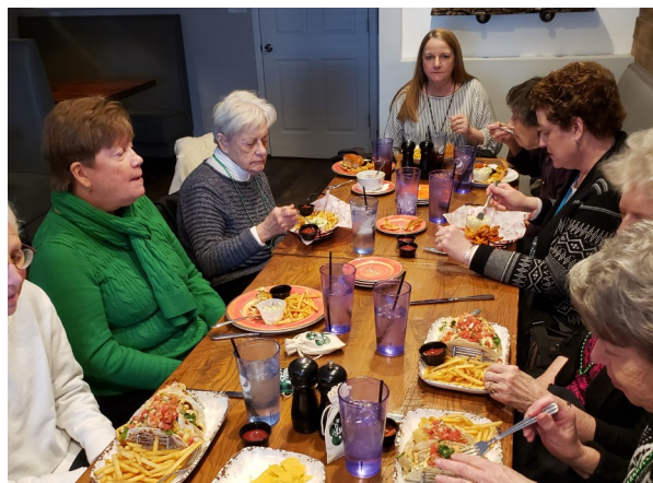
Photos (top) - Volunteers at Select Seconds; Photo (Bottom Left) - Volunteers at Gift Shops; Photo (Bottom Right) - Lunch Bunch at Ragin’ Reef.