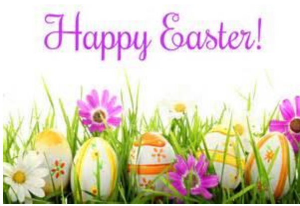
April 16, 2017

The Gift Shop's profit for February was $3,107.86